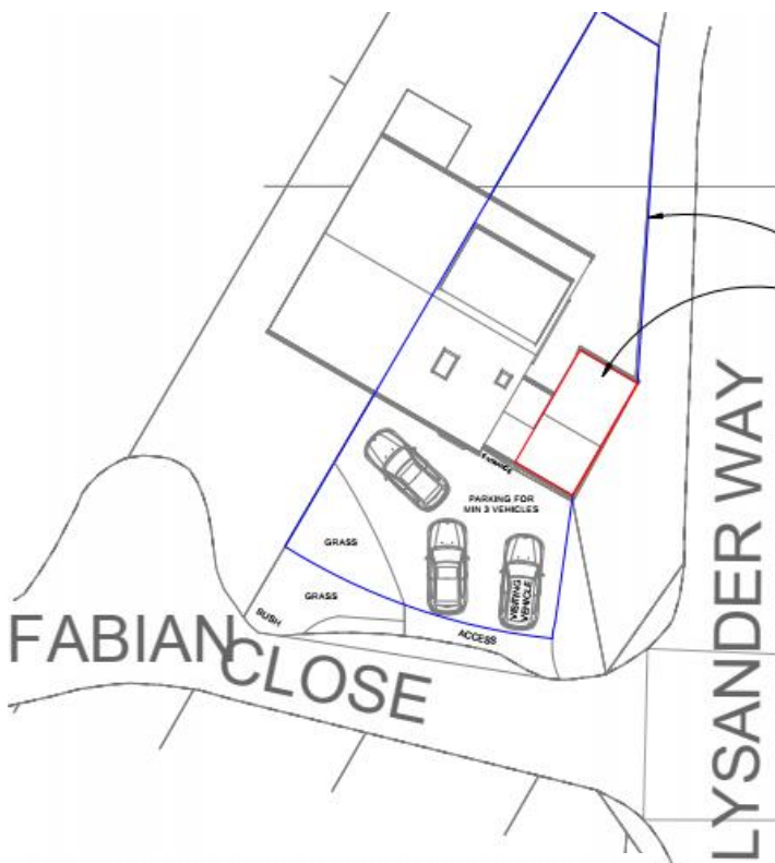
BLOCK & PARKING PLAN 1 : 200